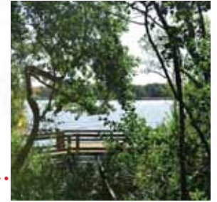
mixed deciduous woodland