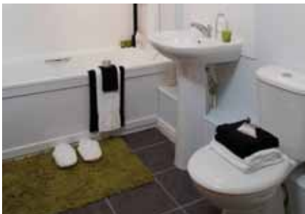
Photographs depict typical Thames Valley Housing interiors.